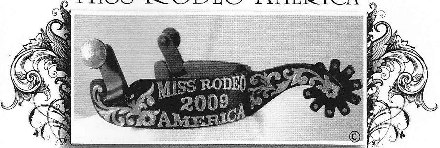
1" BAND, RANCHER CUSTOM SHANK, RUBIES IN FLORALS, LARGE CUSTOM 10 PT. INLAID ROWEL