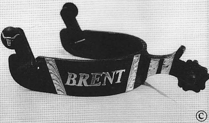
BRENT LEWIS SPUR 1" BAND, BEERS SHANK MEDIUM CLOVERLEAF ROWEL