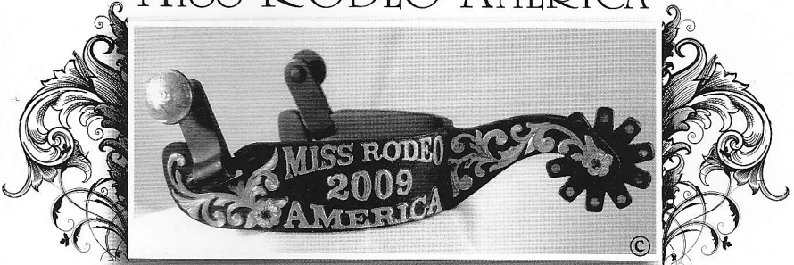
1" BAND, RANCHER CUSTOM SHANK, RUBIES IN FLORALS, LARGE CUSTOM 10 PT. INLAID ROWEL