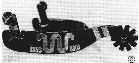
KING RANCH SPUR 1" BAND, RANCHER SHANK LARGE 10 PT ROWEL