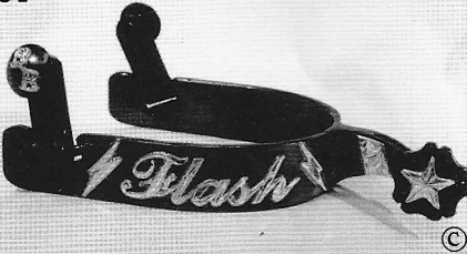
3/4" BAND, STAR SHANK, MEDIUM CLOVERLEAF ROWEL